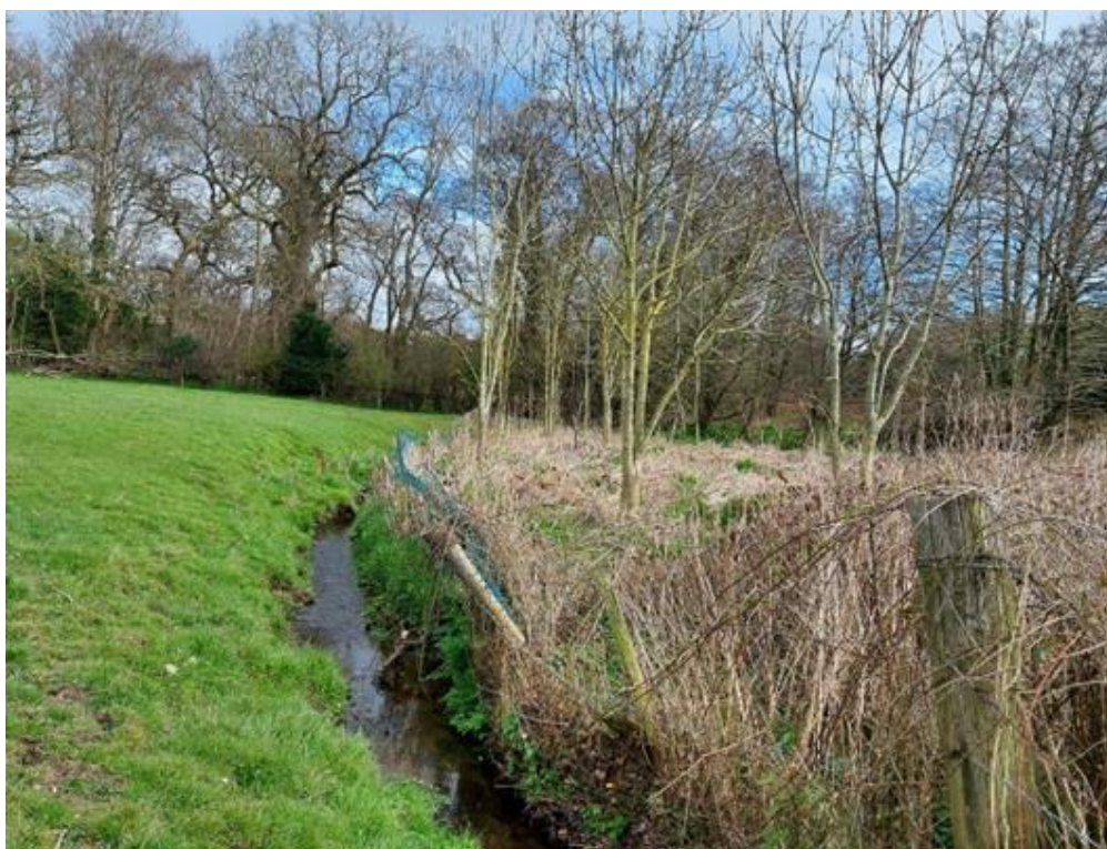
Wepre Brook A55 reach