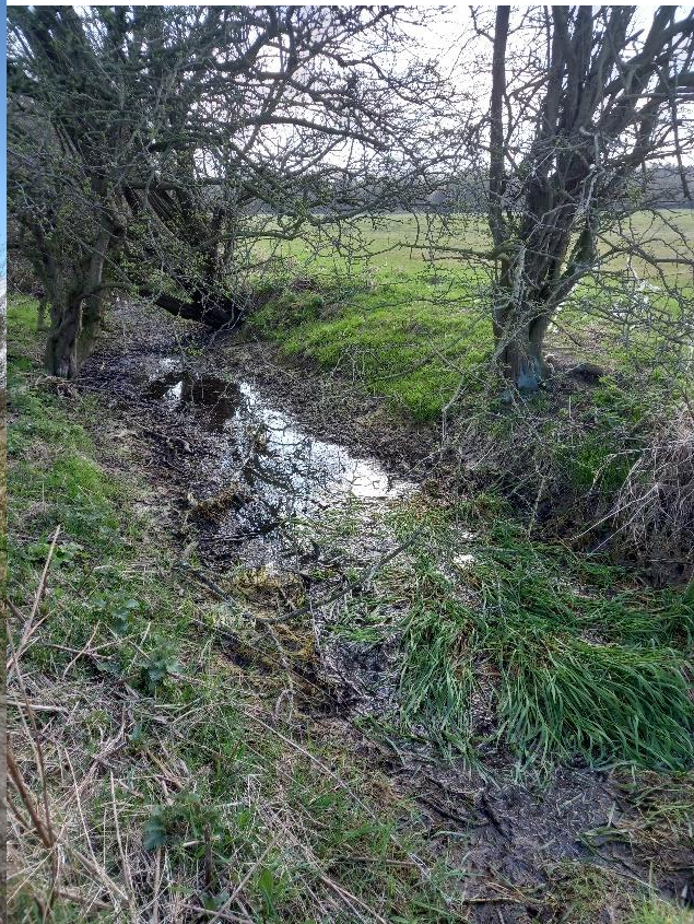
Elton Lane Ditch 1