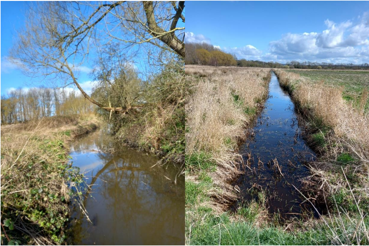
Thornton Ditch 4