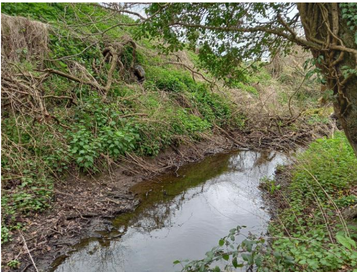
Moderate section within Newbuild Infrastructure Boundary