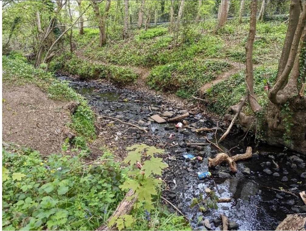
Wepre Brook, Northop Hall reach