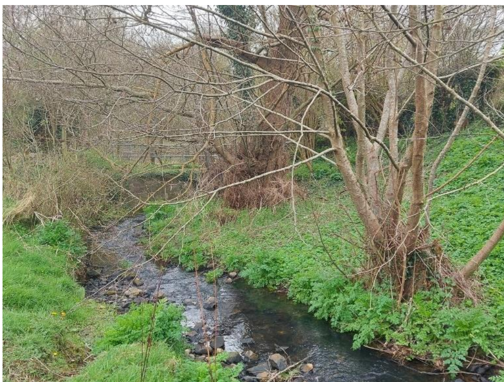
Wepre Brook Brookside reach