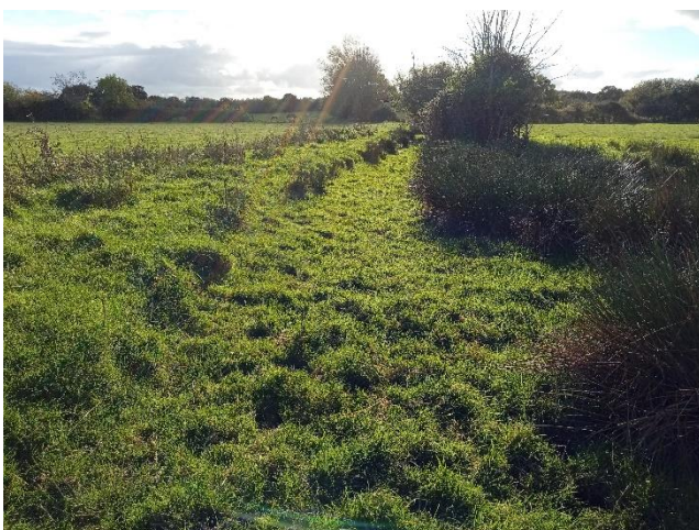
Mancot Brook Tributary