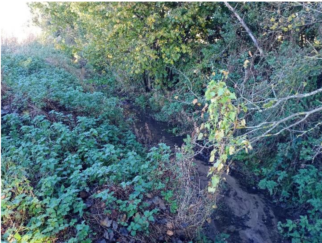
Northop Brook Tributary 2