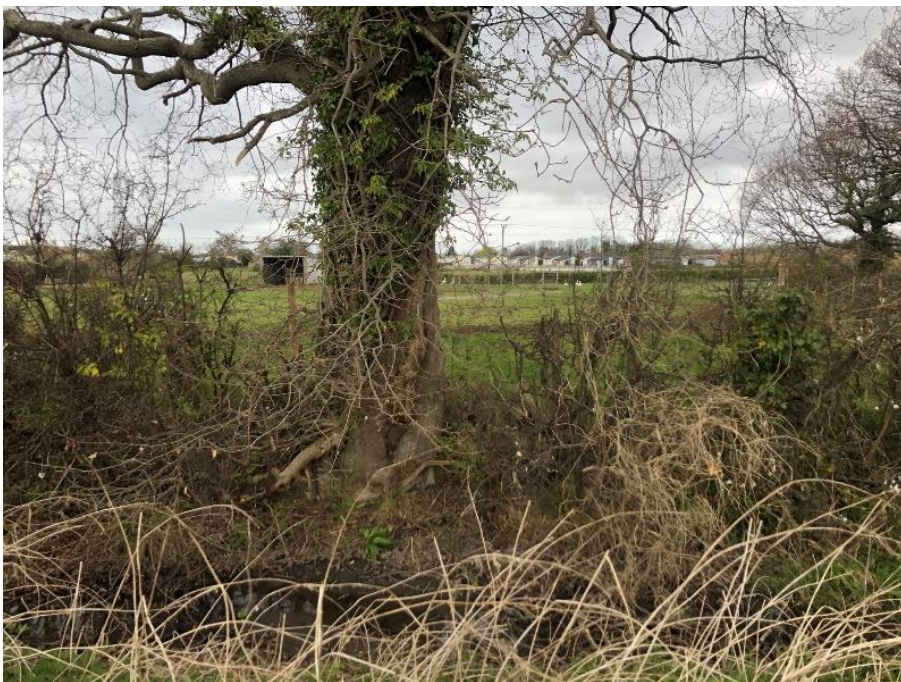
Downstream Moderate reach