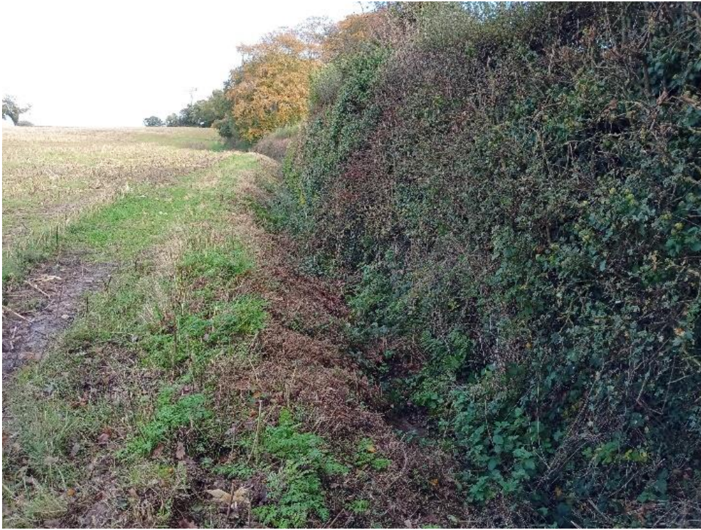
Northop Brook Tributary 1