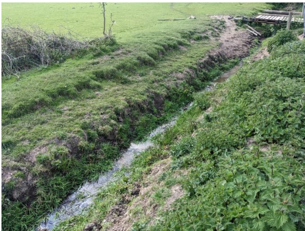
Mancot Brook - Upstream Reach