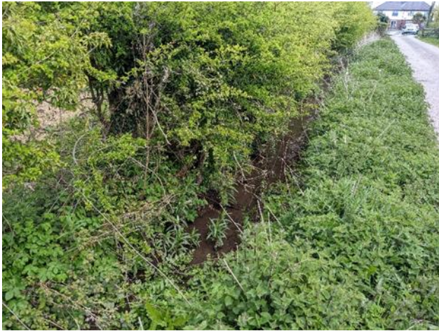
Mancot Brook - Downstream Reach