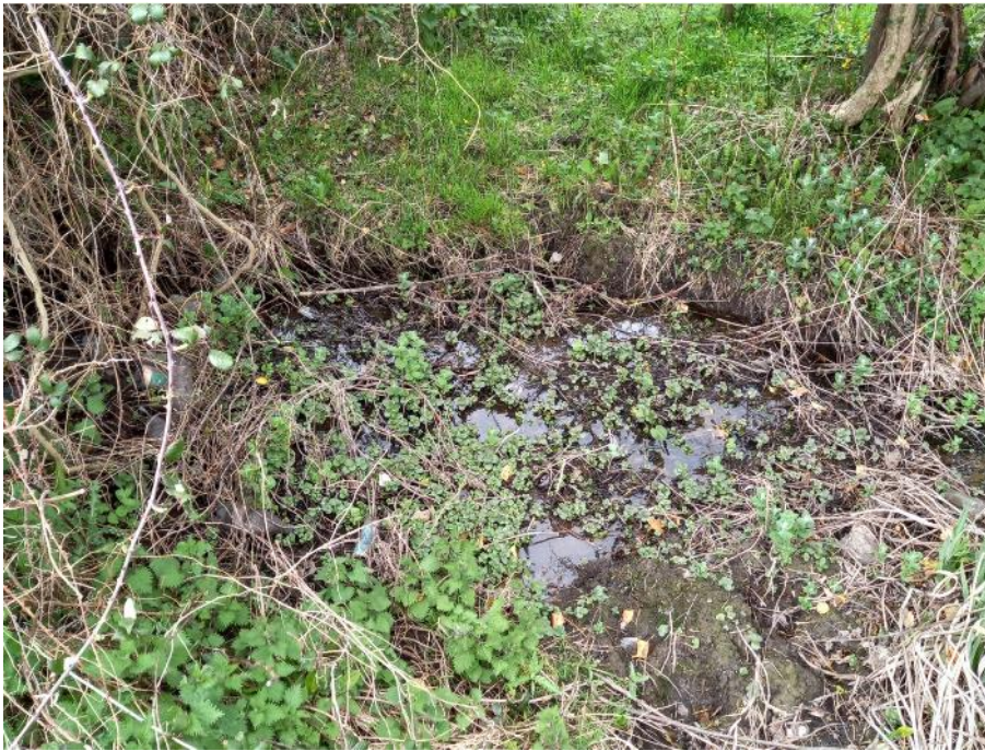
Upstream Fairly Poor reach